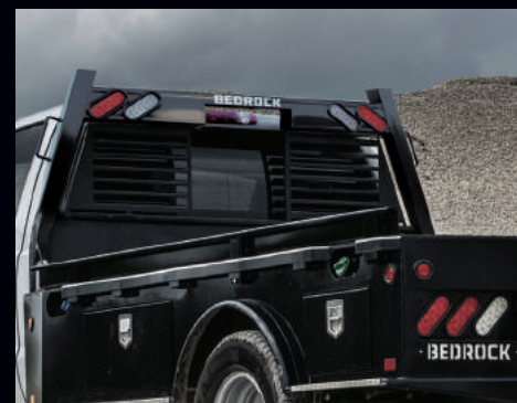
Hauler Headache Rack