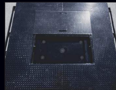
Factory Gooseneck Box

*available for Ford 2017 Super Duty Take Offs