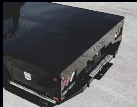
Straight Back Bed