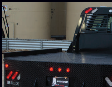
3/16" Diamond-Plate Deck